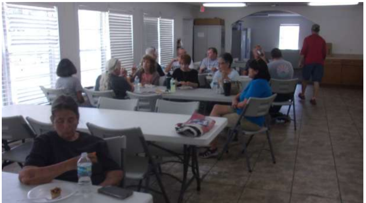
Picture 6 - The volunteers enjoying a super free lunch.