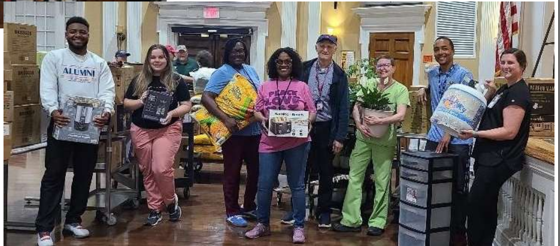
Picture 2 - A picture of the VA helping team thanking the Knights team for the wonderful veteran and hospital donations.