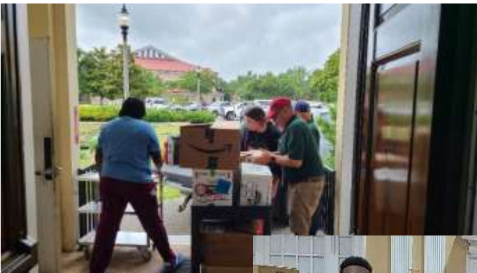
Picture 1 - Off-loading of the four trucks with the help of VA Hospital workers.